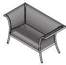
metal rod seat