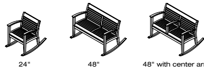
25" x 34" x 24" 25" x 34" x 48" 25" x 34" x 48" d x h x l

Rocker is available in 24" and 48" lengths and constructed of premium furniture grade teak with no finish. The rockers are only available in the 17-1/2" height. The seat and back are the same profile as the benches. The 2 person rocker (48" length) is available with an optional single center arm. The rockers ship fully assembled.