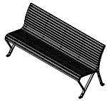
w/o end arms

Village Green meets BIFMA performance and safety standards.